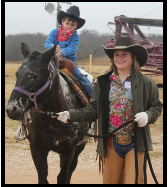
Riding Santa's Ponies!